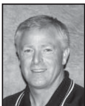
Ed Fye Track & Field