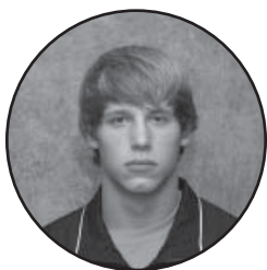
RS - HD Sader